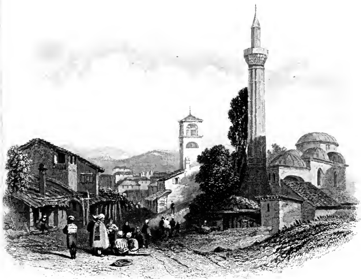
Painted by J. Stanfield from a Sketch by W. Page